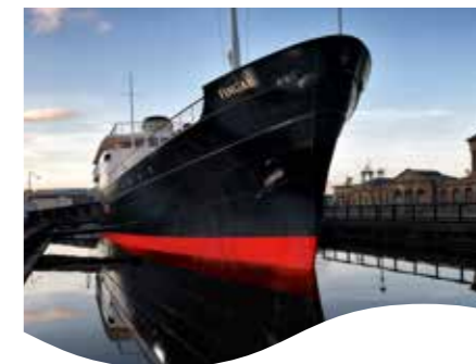
Photo opportunities everywhere. A crew whose sole aim is to ensure that every single detail is taken care of, proud to be entrusted with creating the memories you'll treasure forever.

A wedding venue truly like no other. Curved walls, portholes, deck spaces and 22 luxurious cabins for your guests. The magnificent Skerryvore Suite for the newlyweds.